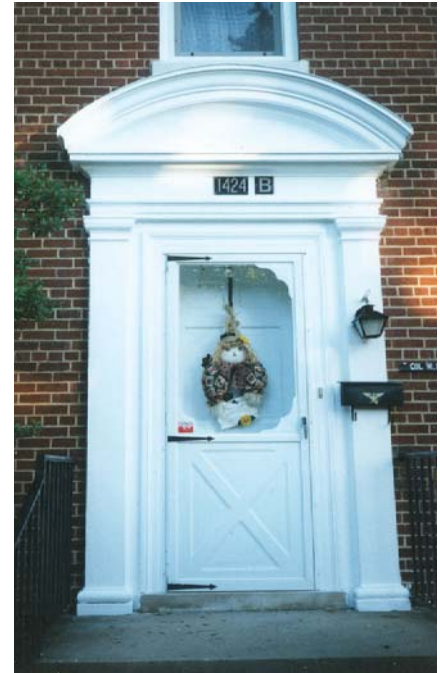
LBC over wood door frames at Fort Knox, KY.

This warranty does not extend to, nor shall Fiberlock Technologies be liable for any damage resulting from any abuse of the encapsulated surface by the tenants or occupants, improper maintenance, water damage, or other conditions beyond Fiberlock Technologies' control. The sole and only liability under this warranty shall be, at Fiberlock Technologies' option, either to replace the product if proved defective or to refund the purchase price paid. Fiberlock Technologies shall not be held liable for any incidental damages, or for any consequential damages to property, or any losses of revenue which may have been caused by a defect or failure of the product. The purchaser of this product must notify Fiberlock at 150 Dascomb Road, Andover, Massachusetts 01810 (800-342-3755) within 45 days to advise of any suspected manufacturing defects. This warranty gives the purchaser specific legal