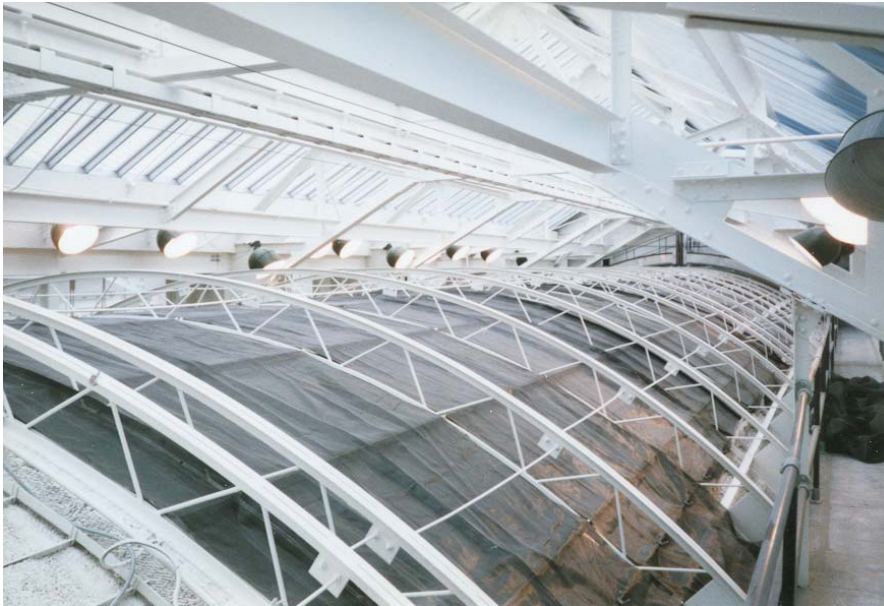
Lead-painted steel coated with LBC, National Gallery of Art, Washington, DC

the New York State Department of Health, and meets or exceeds the abatement requirements of all 50 states.