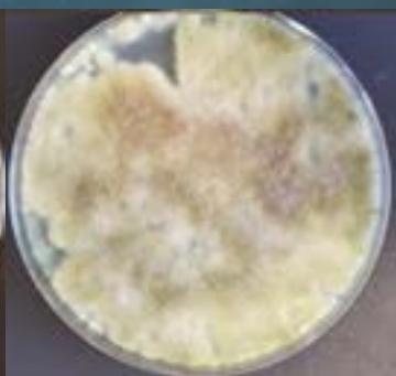
4 week mold growth on untreated PDA samples