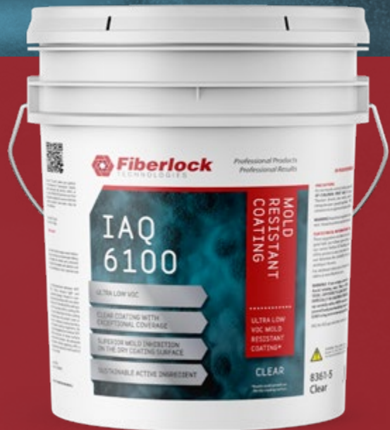
NEW 8361-5 IAQ 6100 5 GALLON

*.72 g/L (calculated as per EPA) / 2.85 g/L (calculated as per SCAQMD)