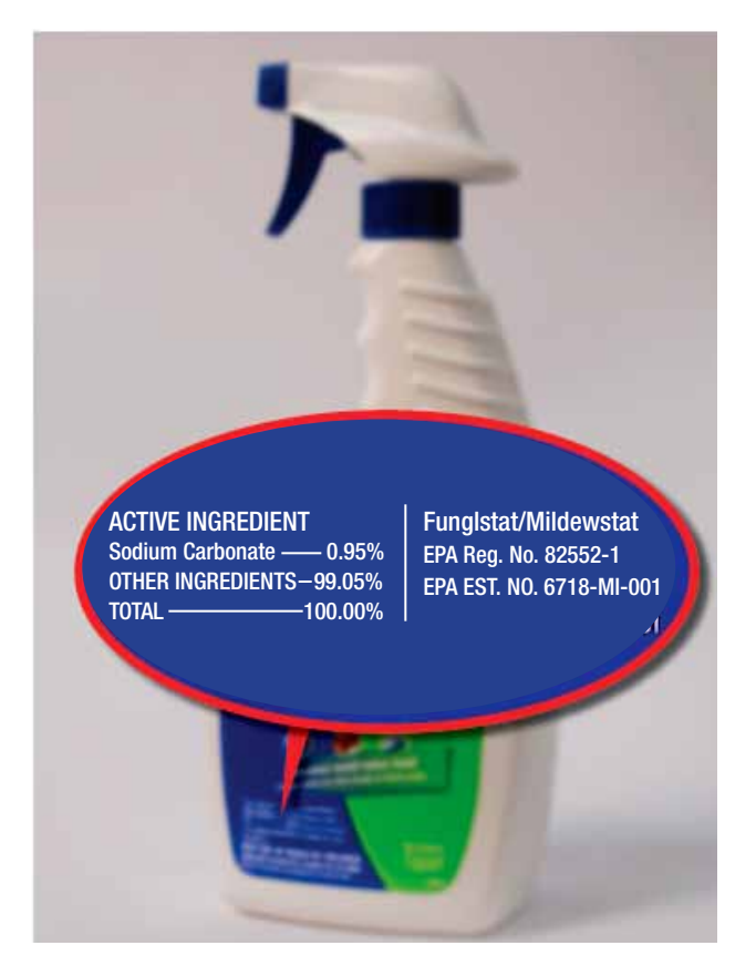
Figure 1. This active ingredient in this mold control spray is sodium carbonate. Sodium carbonate is safe, but our test found that it wasn't effective in preventing mold growth on wood.

that is present in some toothpastes and foods, and is 'Generally Regarded as Safe' (GRAS) by the Food and Drug Administration.